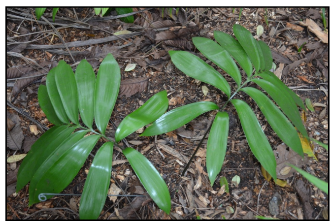
Zamia splendens typical sized plant