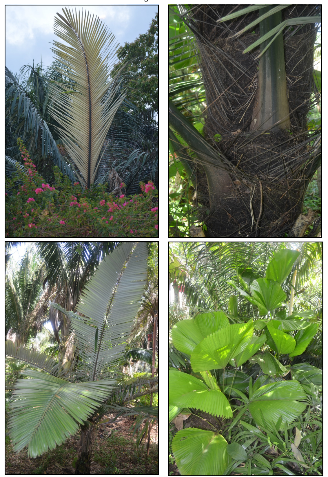
Allagoptera caudescens (formerly Polyandrococos caudescens)