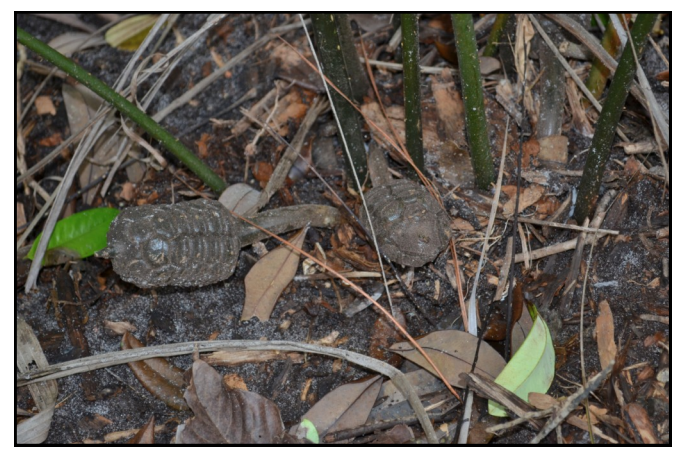
Zamia splendens female cone