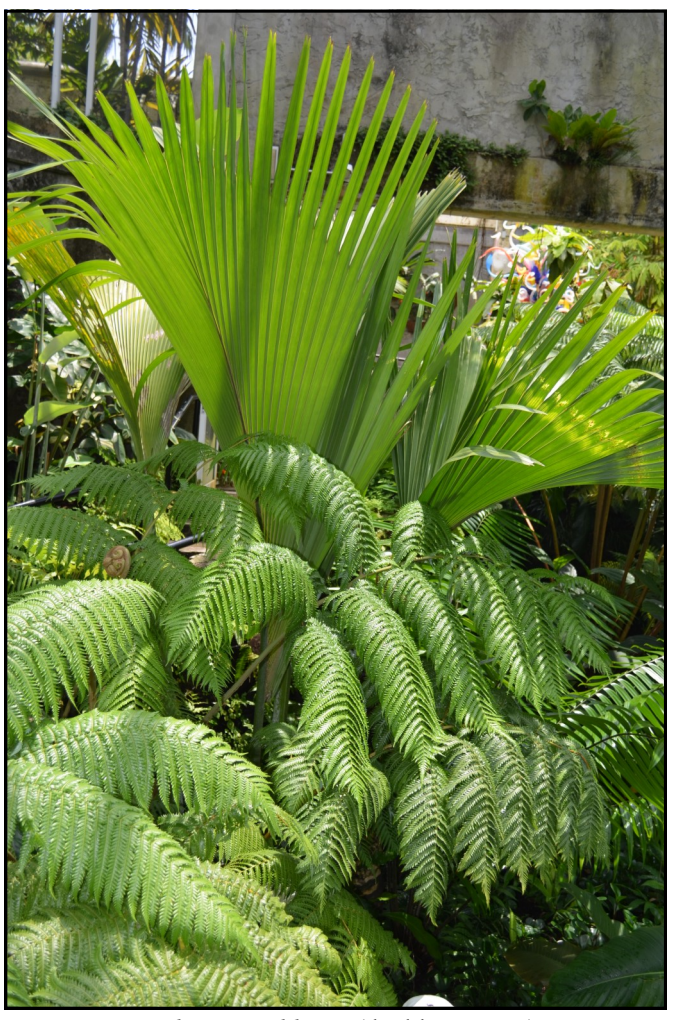
Lodoicea maldivica (double coconut)