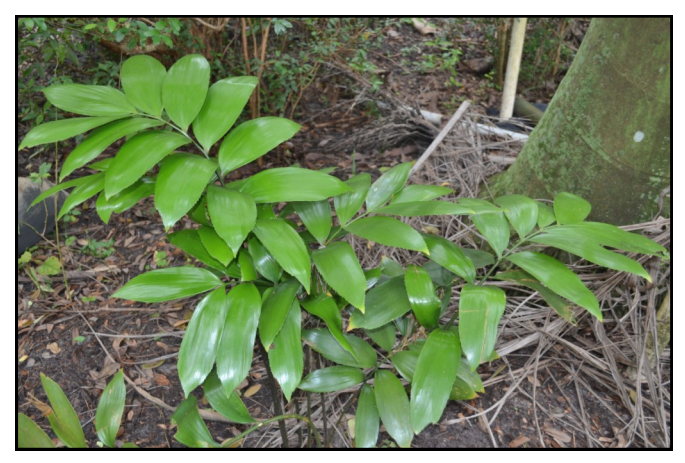
Zamia splendens with multiple offshoots