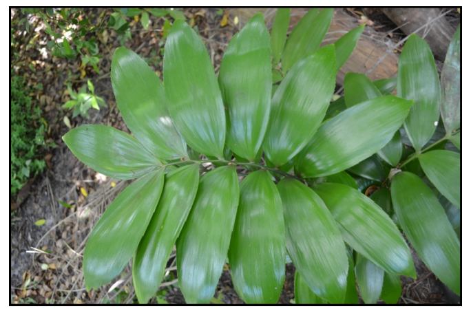
Zamia splendens leaf detail