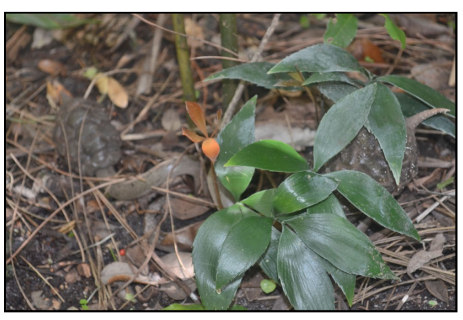
Zamia splendens seedlings beneath mother plant in the Beck garden.