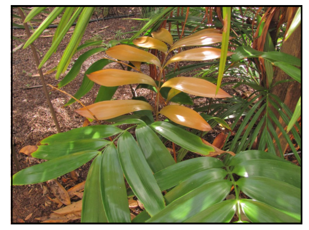
Zamia splendens with new growth growing in Dale Holton's garden.