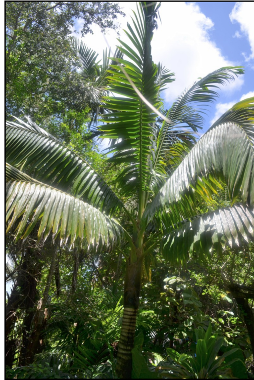
Neoveitchia storckii - Medium sized native to Fiji. It has a black crownshaft and wide overlapping leaflets.