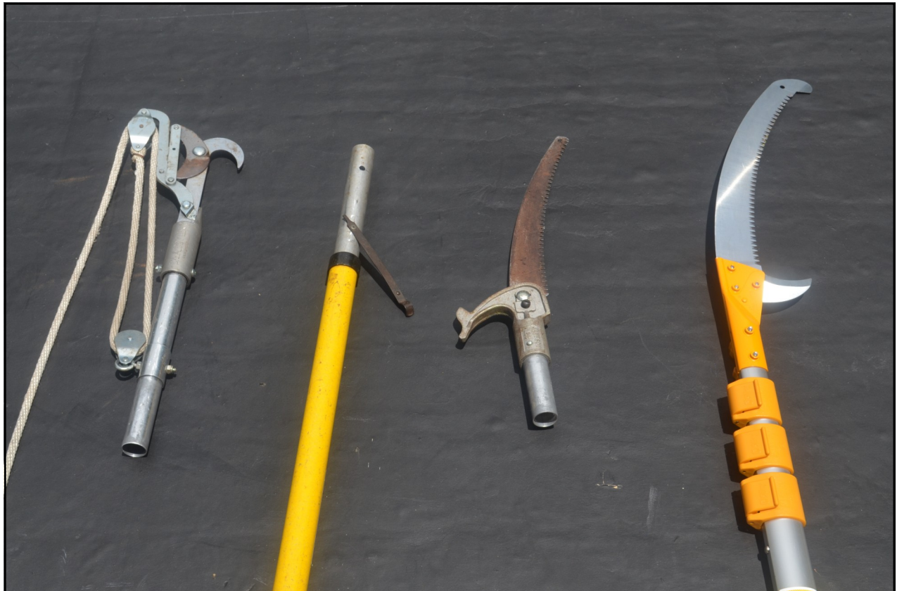
LEFT TO RIGHT: Bypass pruner; 12' telescoping pole with "leaf spring/pin" attachment; pole saw head with hanging hook; and 20' long aluminum telescoping pole with locking pins and toggle clamps

Opinions expressed and products or recommendations published in this newsletter may not be the opinions or recommendations of the Palm Beach Palm & Cycad Society or its board of directors.