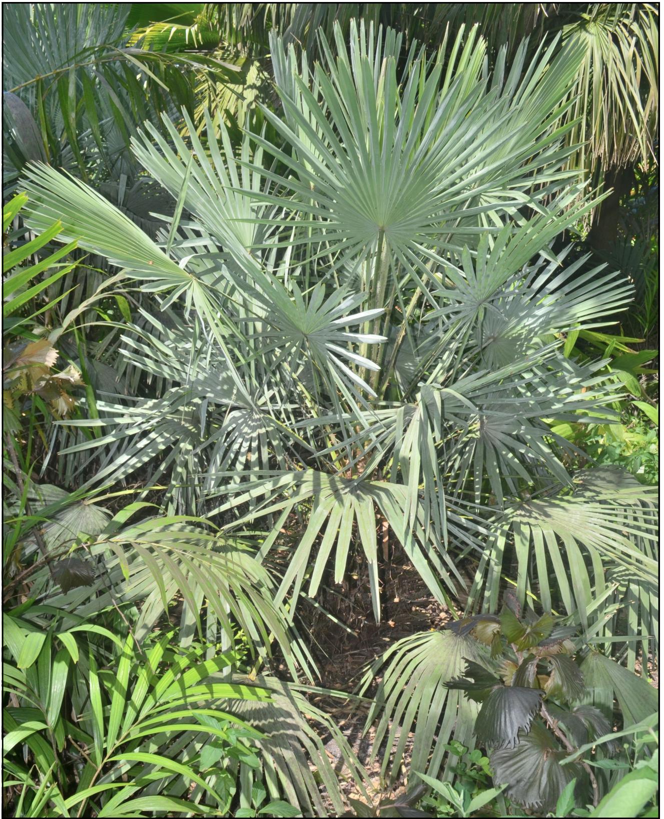
Copernicia alba growing in the Beck garden