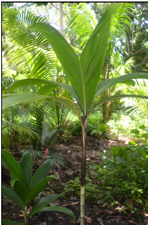
Dypsis mirabilis - Is native to Madagascar. It retains its bifid leaves and forms a dark purple crownshaft.