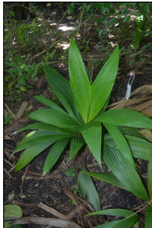
Calyptrogyne ghiesbreghtiana - Features bifid leaves on subterranean stems. Emergent fronds are salmon color.