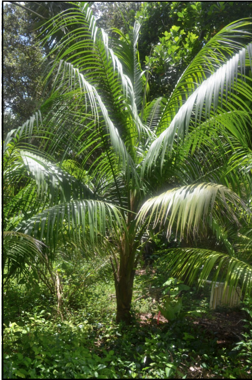
Calyptronoma plumeriana - Graceful palm native to Hispaniola. It prefers moist growing area.