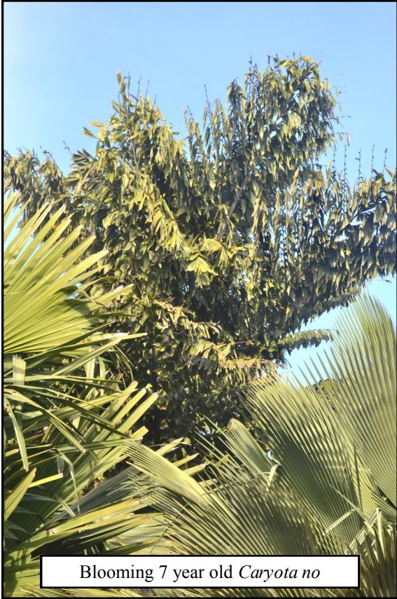
Blooming 7 year old Caryota no