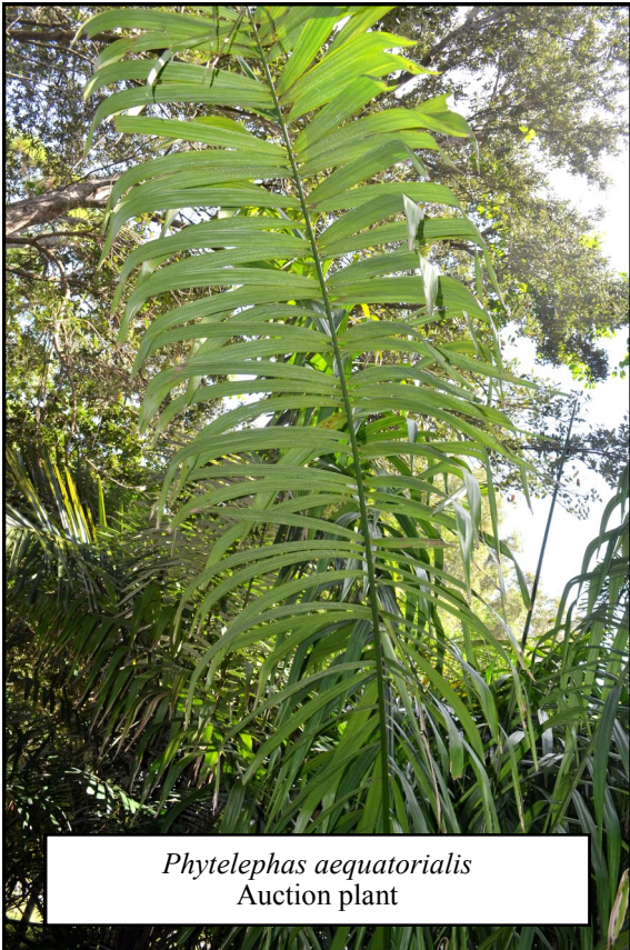
Phytelephas aequatorialis Auction plant