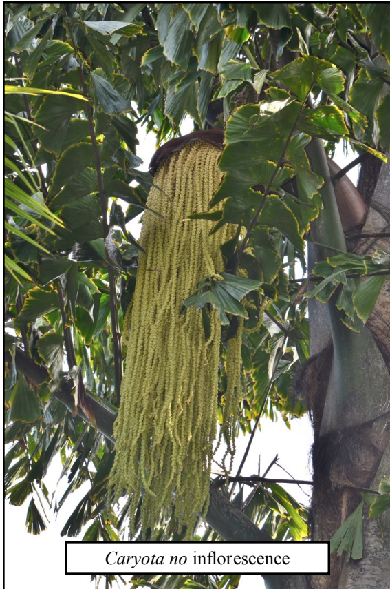
Caryota no inflorescence