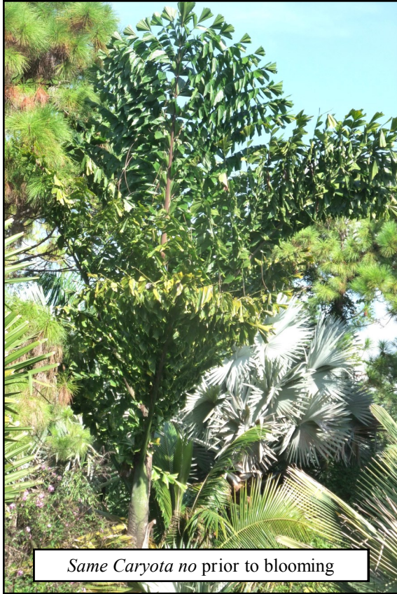
Same Caryota no prior to blooming