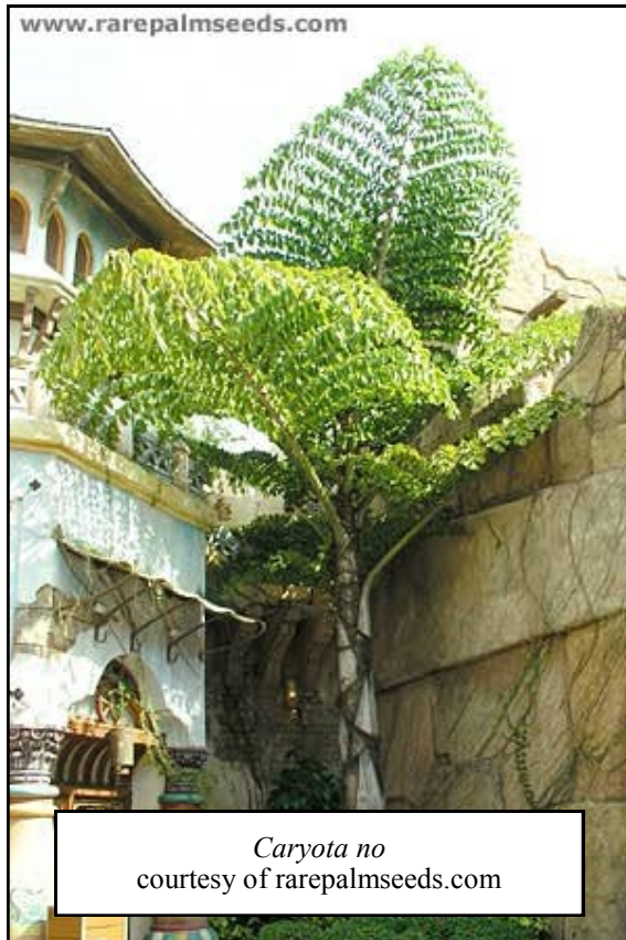
Caryota no