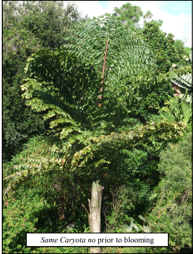
Same Caryota no prior to blooming