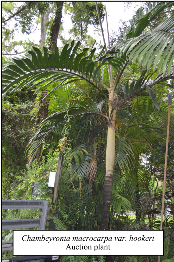
Chambeyronia macrocarpa var. hookeri Auction plant