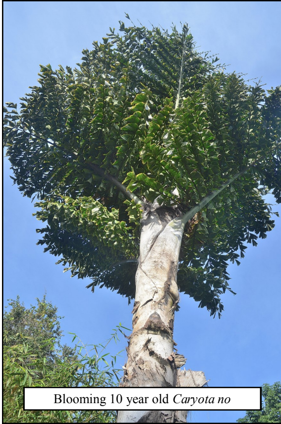
Blooming 10 year old Caryota no