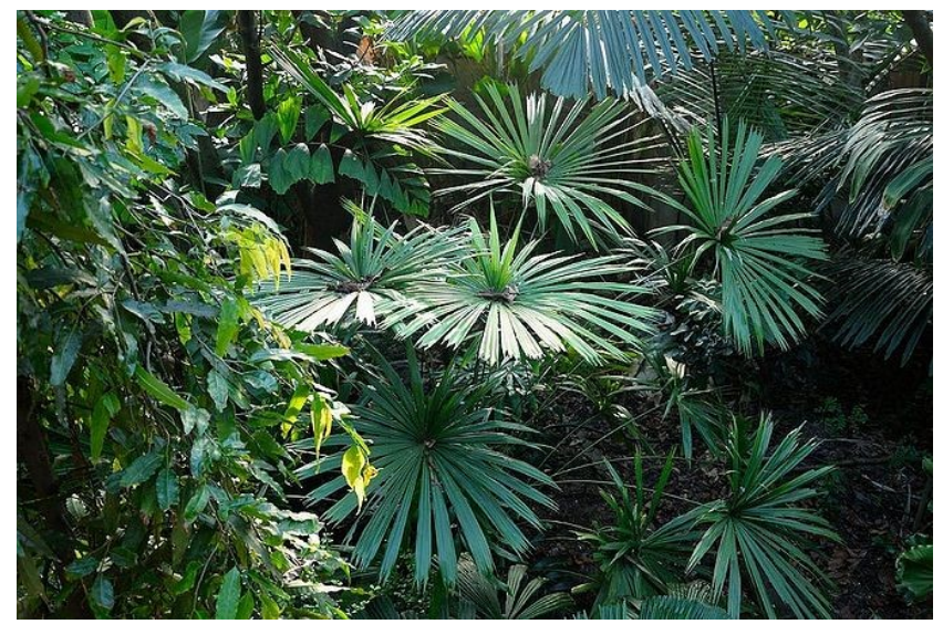
Licuala distans