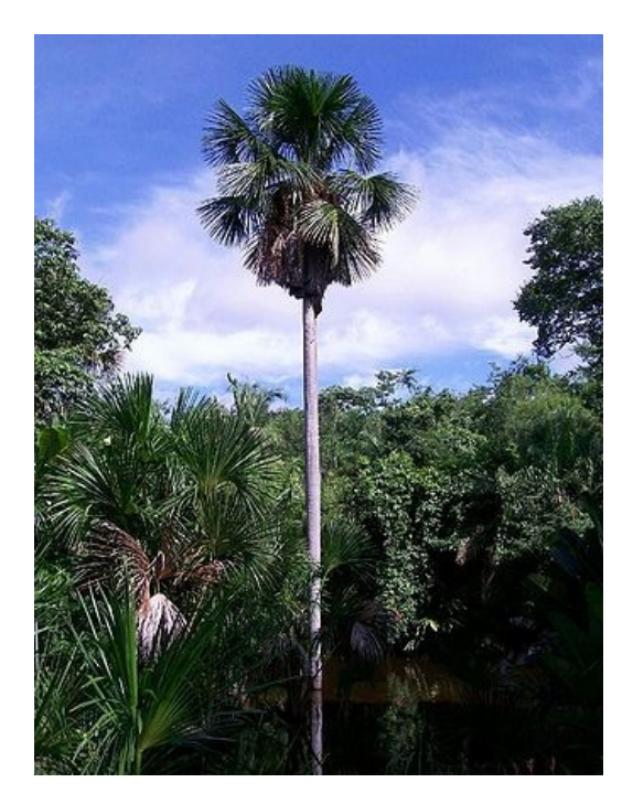
Mauritia flexuosa