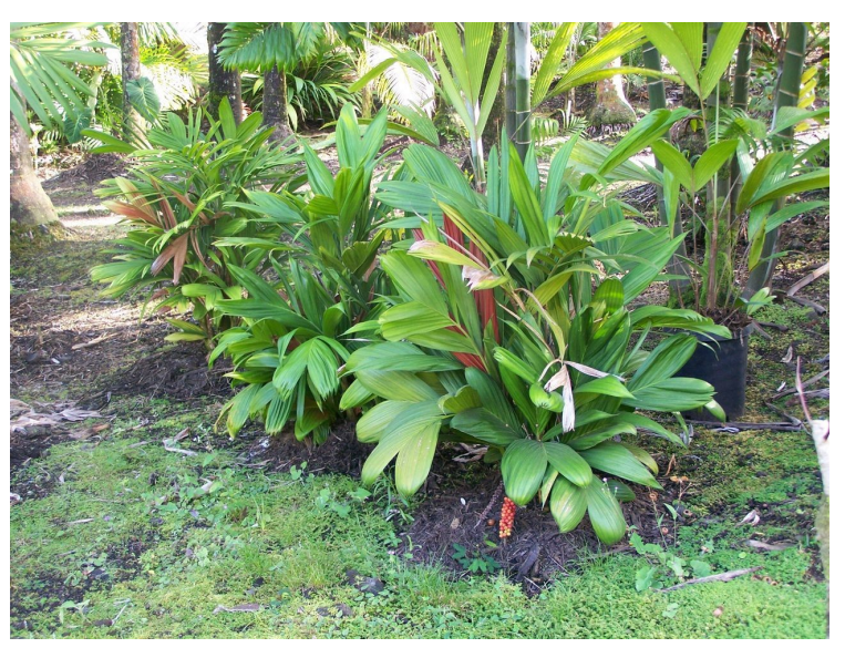
Calyptrocalyx elegans var. 'boalak'