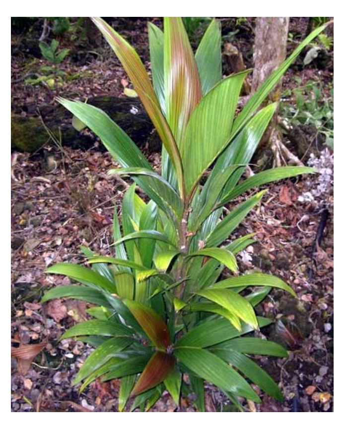
Calyptrocalyx sp. 'sanumb'