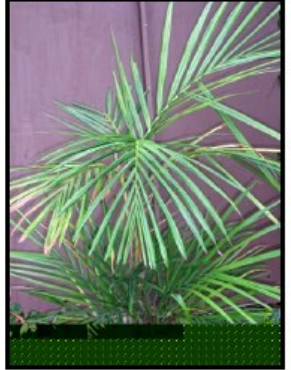
Calyptrocalyx forbesii planted 6 years ago

For permission to reproduce any article that appears in this publication, contact the Palm Beach Palm & Cycad Society editor at netopalms@gmail.com