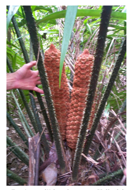
Zamia roezlii female cone in Valle del Cauca, Colombia

When I acquired my Z.roezlii , the soil was a base to alkaline mixture with heavy perlite and top layer of small peat rock. They grew well in that medium and showed decent growth results. When they out grew the 4 in. pots and needed to be repotted into one gallon pots, I changed the soil mixture in an attempt to recreate natural soil medium. Currently mixture consist of sphagnum peat moss, coarse silica, and perlite. The slightly acidic soil mixture retains moisture better and has proven excellent growing results as they have flushed twice in a shorter span.