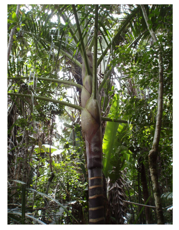
Dypsis ovobontsira