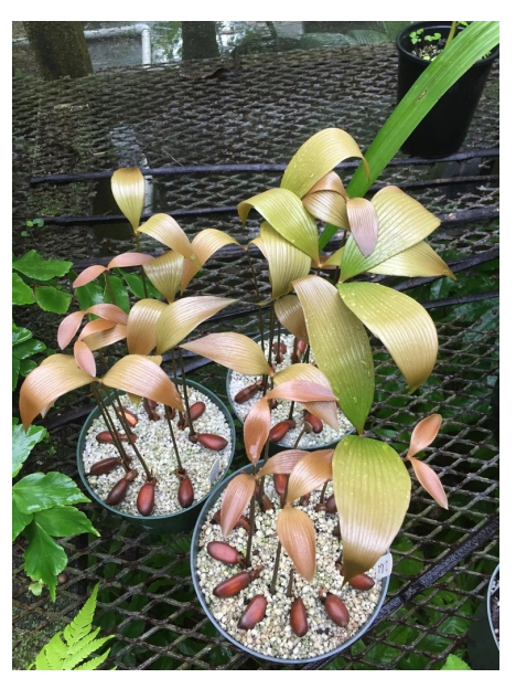
Zamia roezlii seedlings in Miami, FL