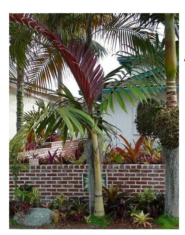
Left: Chambeyroniamacrocarpa var. 'hookeri'

Right: Chuniophoenix nana