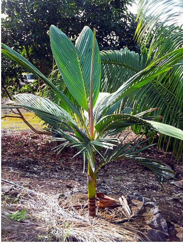
Loxococcus rupicola

Pritchardia martii