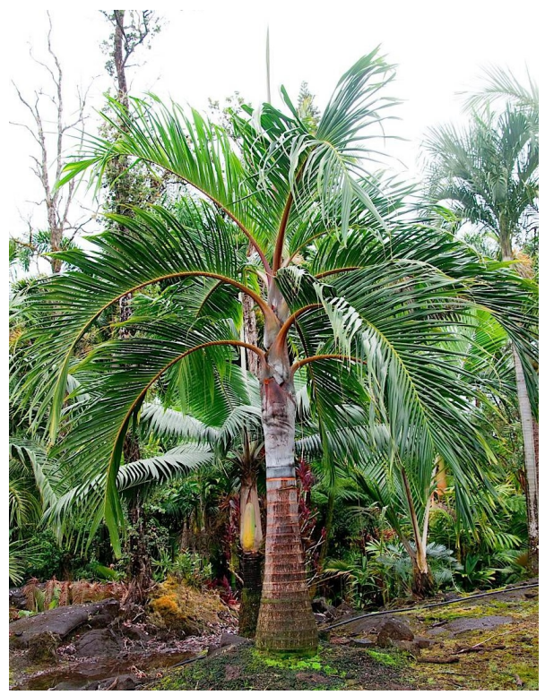
Bentinckia condopanna