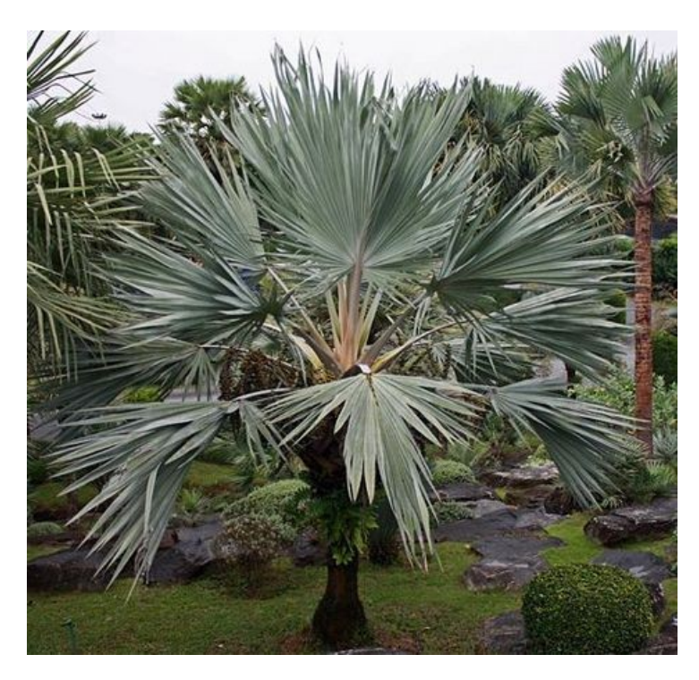
Latania loddigesii

Marojejya darianii