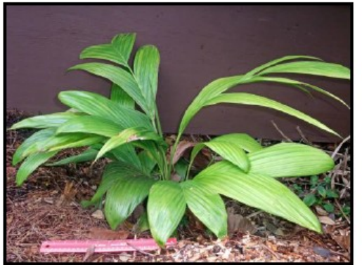
Calyptrocalyx elegans planted one year ago