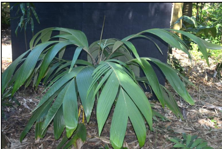
Astrocaryum alatum - 6 years old in the Beck Garden