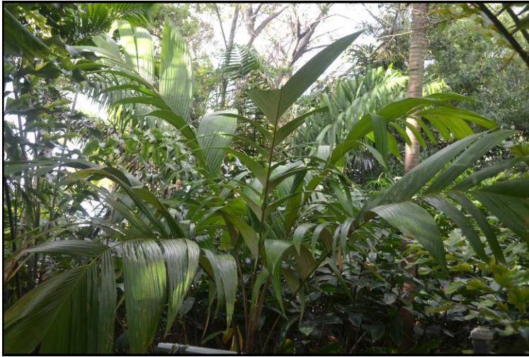
Astrocaryum alatum - 2 years old with 8' long fronds in the Beck Garden