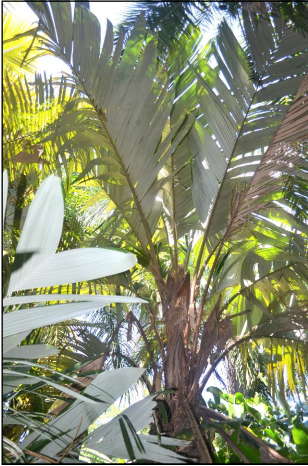
Astrocaryum alatum at FTBG-30 years old