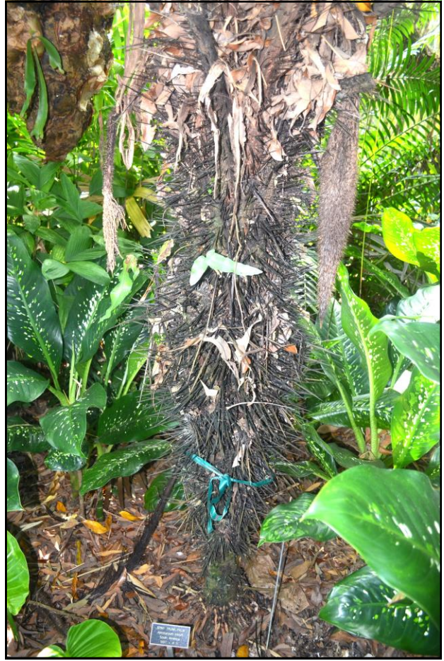
Astrocaryum alatum at FTBG- spiny stem