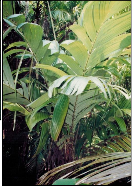
Astrocaryum alatum at FTBG (photo taken 15 years ago current photo on pg.4)