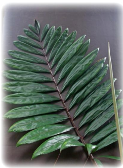
Typical leaf detail