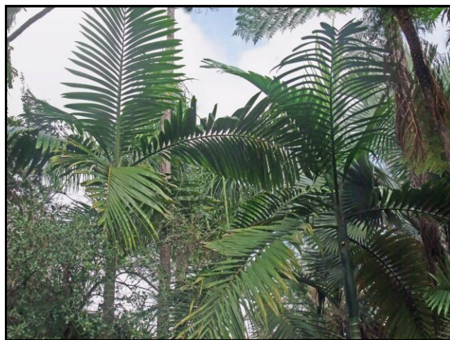
15 year old "watermelon" form specimens measuring 12 feet to bottom of crownshaft