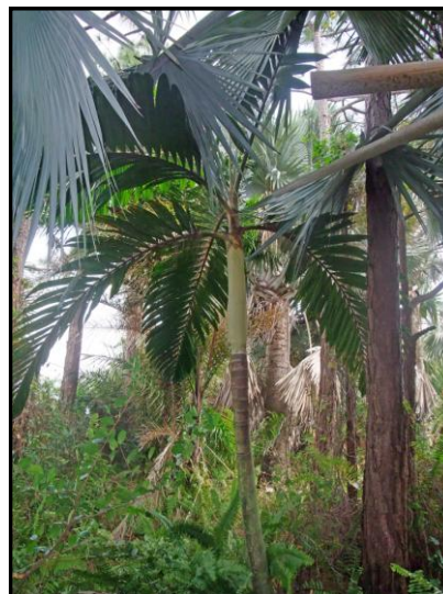
15 year old "hookeri" form